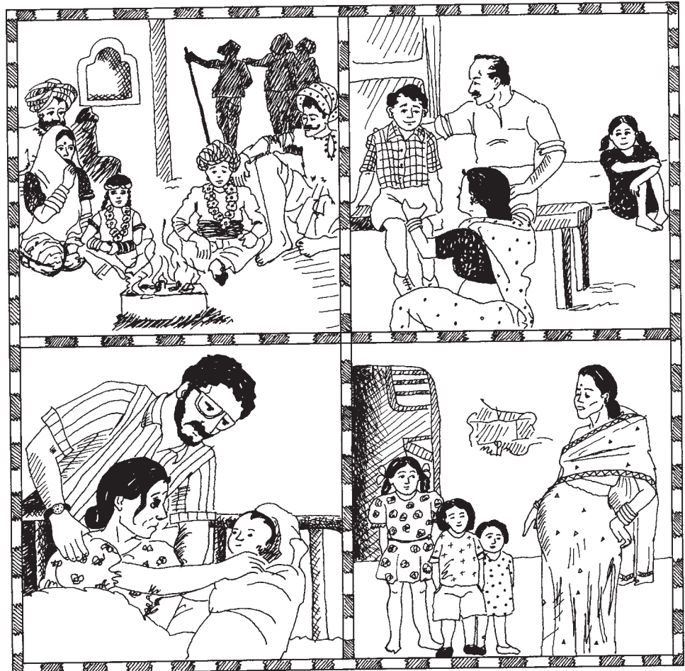
Figure 33.1 Women and health